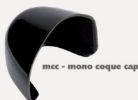
mcc - mono coque cap